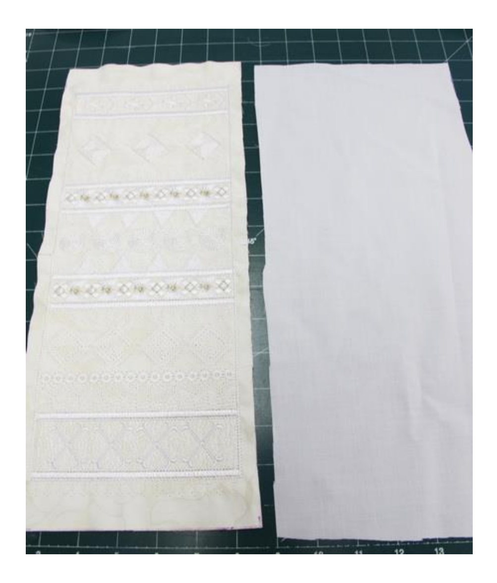
Cut out where you measured on your fabric and also cut out your lining