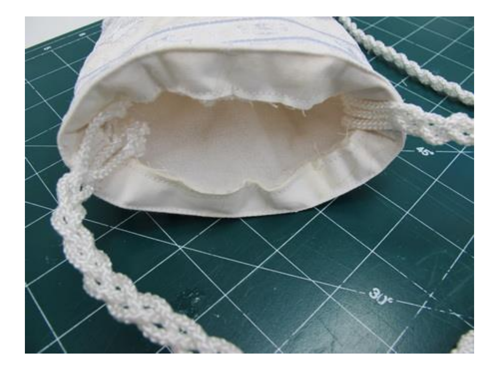
Fold over the top section and straight stitch down