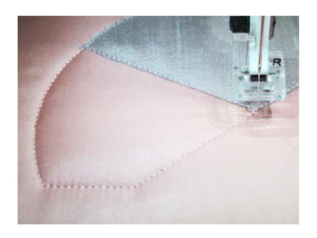
Stitch the first coloured thread out in the colour chart