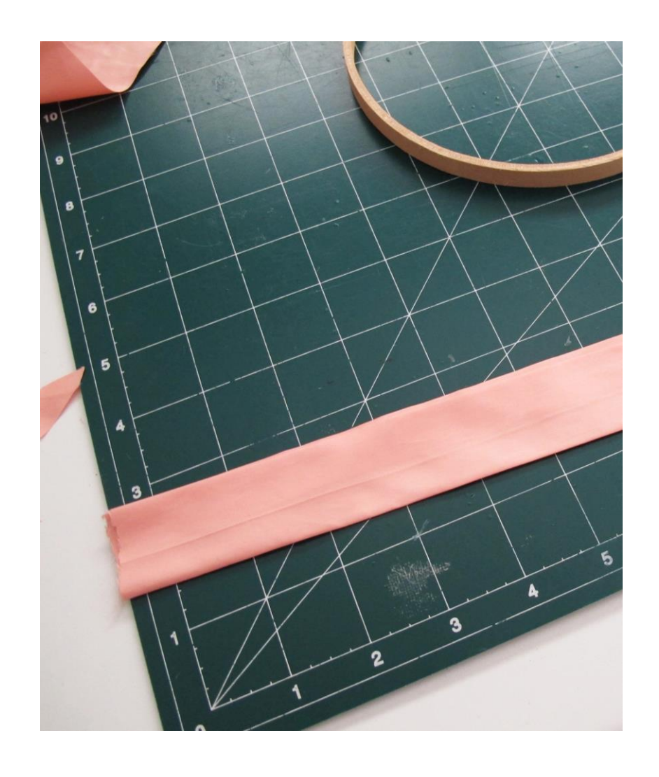
Cut a long strip of fabric, iron each side over