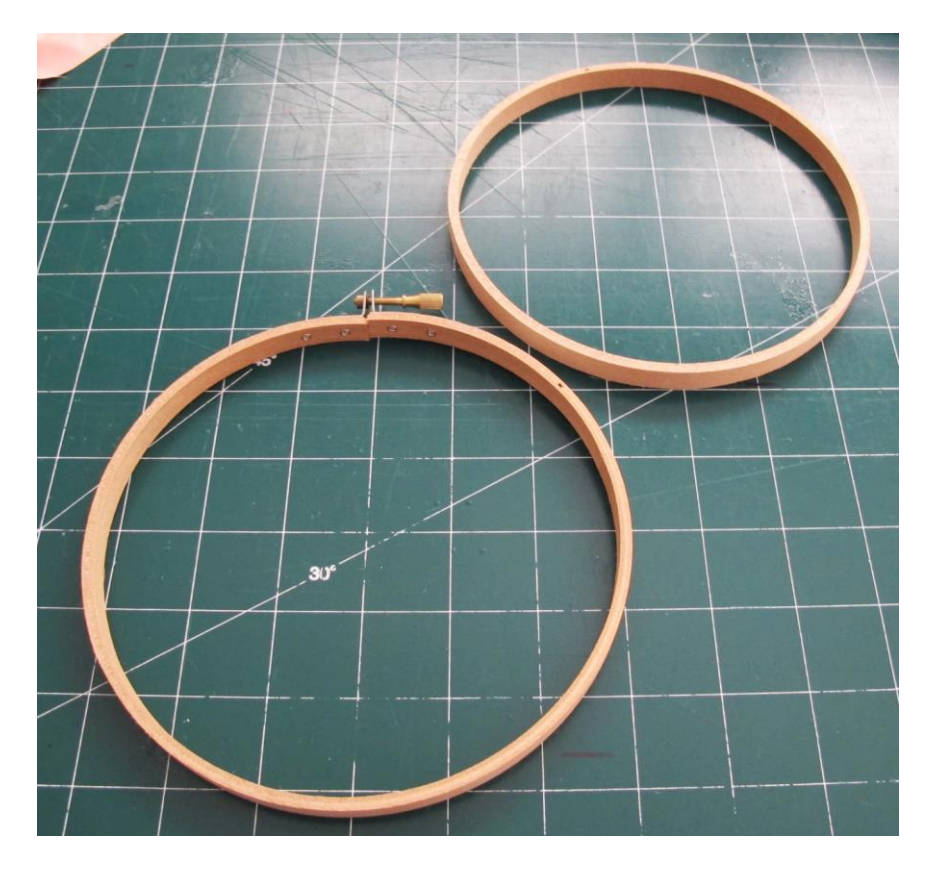
These are the 6 inch wooden Frames used for all four Crazy Patches