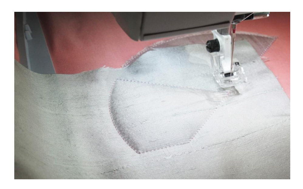
Stitch out the second coloured thread in your colour chart