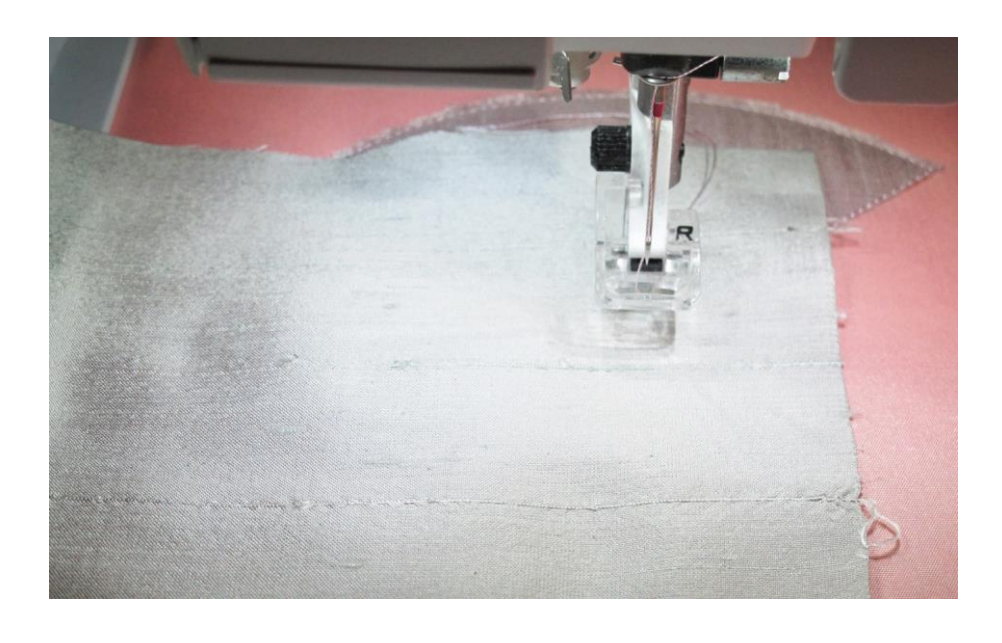
Select a fabric of your choice, large enough to cover the stitches you just stitched out