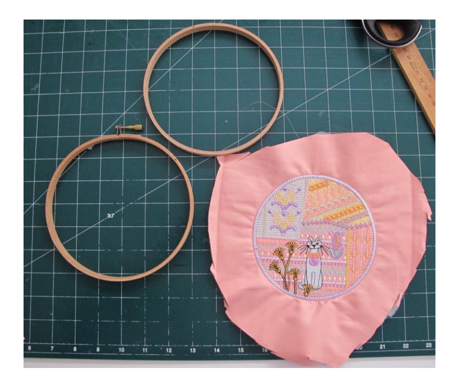
Cut excess fabric leaving enough fabric to fold over the internal hoop