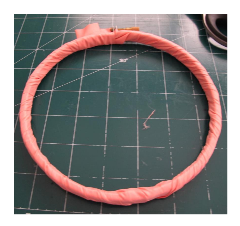
Using your hot glue gun, glue the ends of the fabric strip down