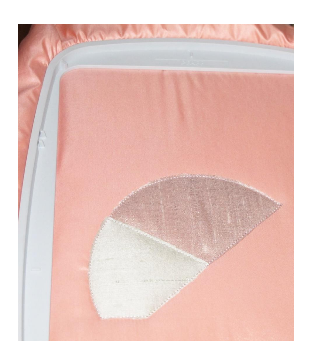
Showing you the finished applique look