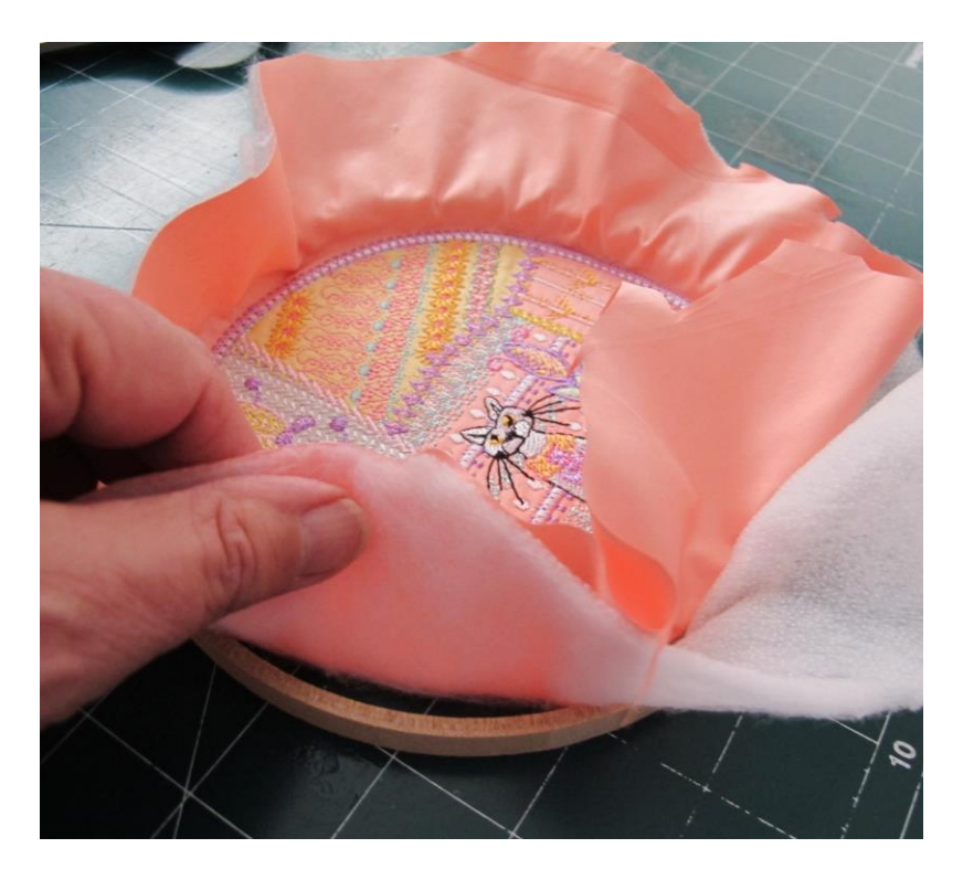
Position your design in the centre of the inner hoop